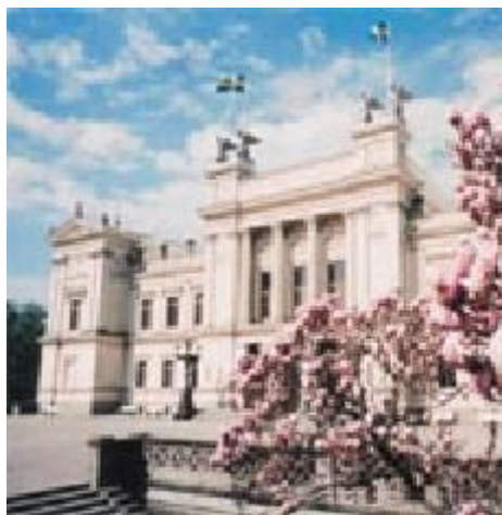
An image of Lund

To ensure that participants enjoy the course and are motivated to learn the information provided, it is important that the academic level is balanced to provide both benefit and enjoyment. The pedagogic level should make the course attractive. The course developers therefore have special knowledge and solid experience specifically for the projects and are involved in devising the teaching material.