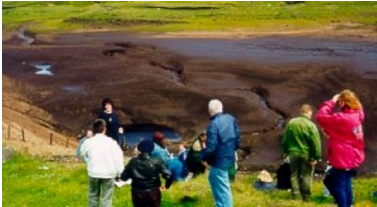
Caretakers observing a vanishing lake in Ireland at the 12th CEI-Conference.