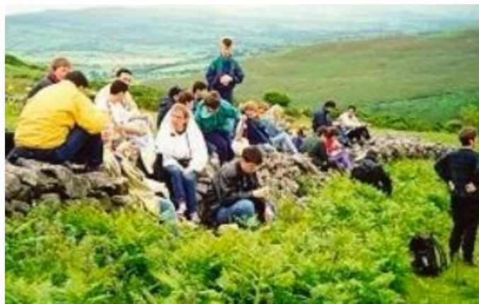
Rural tourism in Ireland at Cei 98

This concept is a powerful, integrative framework, that emphasises the multiple and ecological realms in which it can be observed. Biodiversity refers to the variety and variability among organisms and the ecological complexes in which they occur. These items are organised at many levels, ranging from complete ecosystems to chemical structures that are the molecular basis of heredity. Thus, the term encompasses different ecosystems, species, genes and their relative abundance.