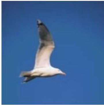
No frontiers or boundaries