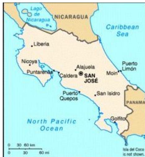
Country map of Costa Rica

Once, Costa Rica was almost covered with tropical forests. But between 1963 and 1983, politically powerful ranching families cleared much of the forests to graze cattle, for beef exporting to Western Europe and United States, where there was a demand for it. In 1983 only 17% of the original forest remained, and there was considerable soil erosion. Although the great loss of rainforest there still was around 500'000 species of animals and plants.