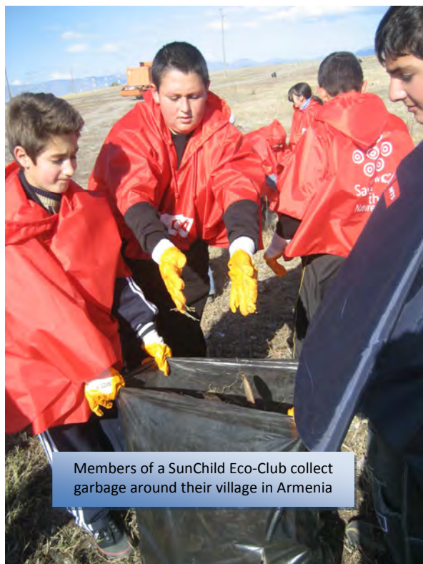
Members of a SunChild Eco-Club collect garbage around their village in Armenia

The films produced within the frame of the educational project were first screened at the 'Children's Film Program' of the SunChild Environmental Festival in 2007. This event, the only festival of this type in the South Caucasus Region, is also a project of FPWC and takes place every second year. Besides the competitive wildlife film program for adults as well as