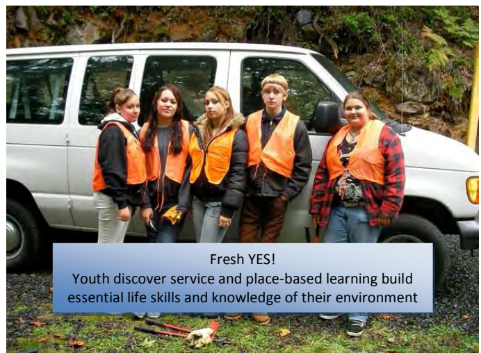
Fresh YES! Youth discover service and place-based learning build essential life skills and knowledge of their environment

The group I am referring to is high school students from Roberts High School that are in a program called Fresh Start at the IKE Box. The program is a two-semester program designed to work with students in 9-11th grade who need a fresh start to their educational careers in a small and intimate setting; something different from the traditional large high schools. The results of this program have been very positive for the students how have participated in it. Many are launched into the Early College High School at Chemeketa